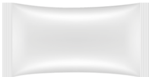
Fig. 1: Anverso